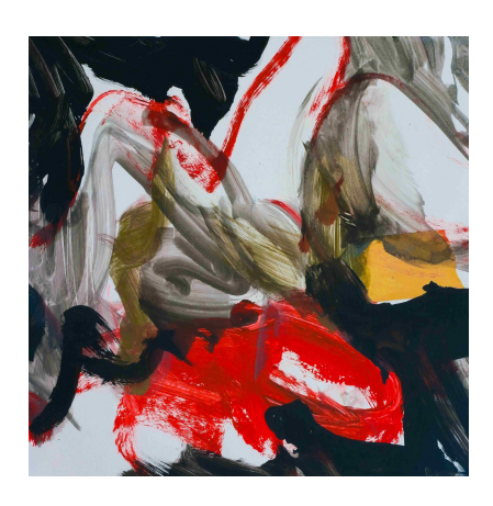
Missing A Beat